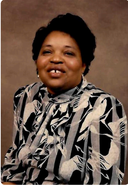
New Photo 1